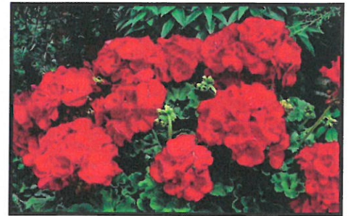
Bright Cherry Red